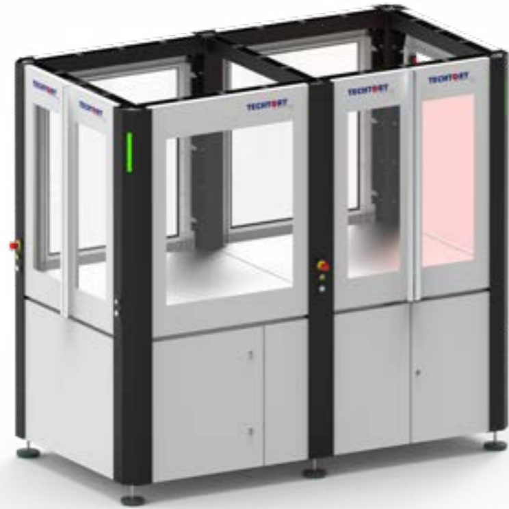
table-cell - 1 x 2